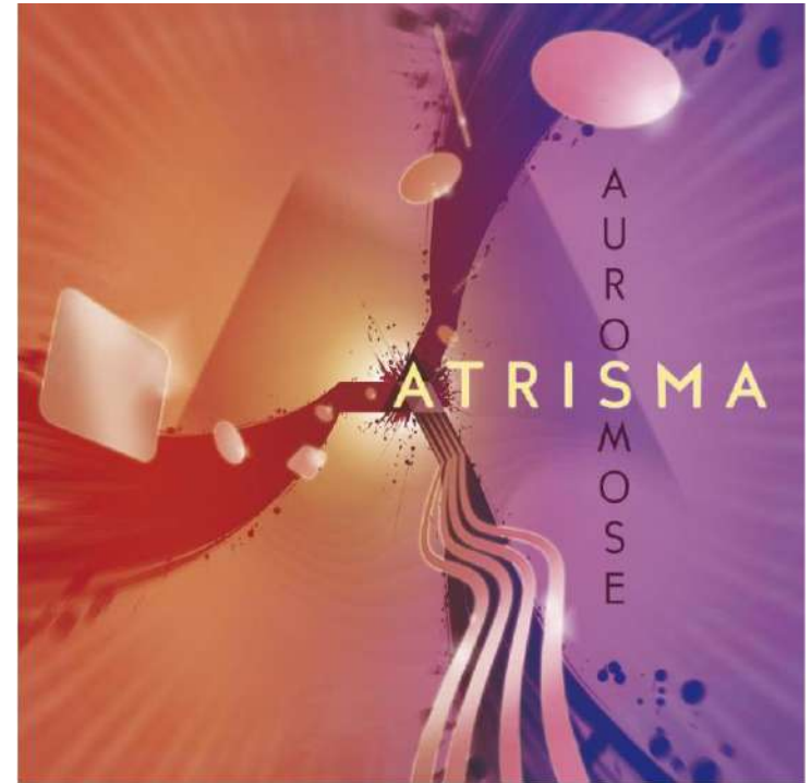
Aurosmose Album - may 2017