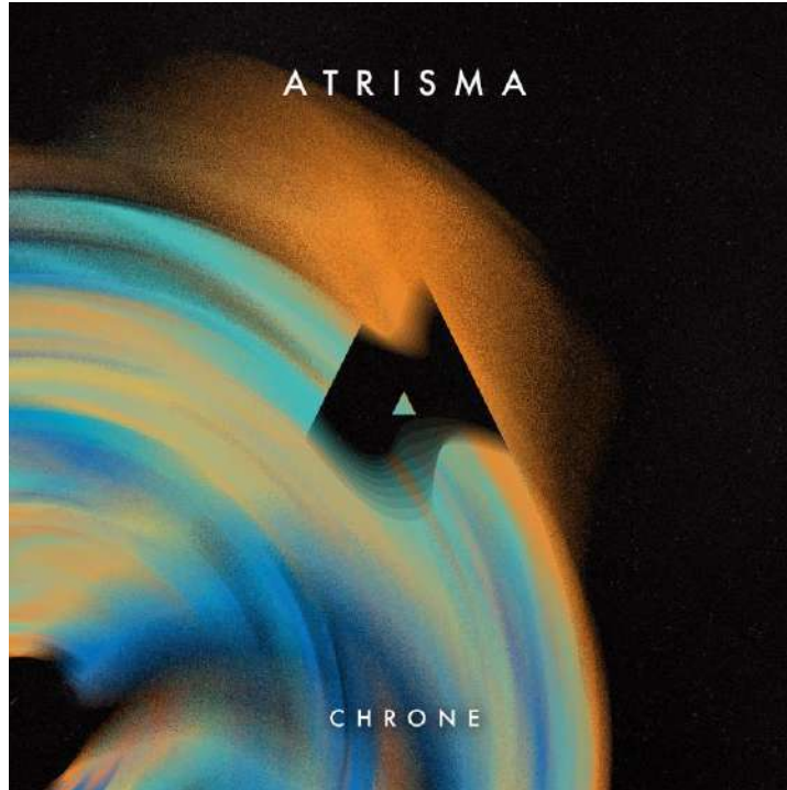
Chrono EP - april 2020